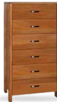
Towerboy 6dr 700w x 1465h x 425d