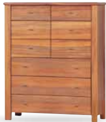
9 Drawer Tallboy 1010w x 1220h x 505d