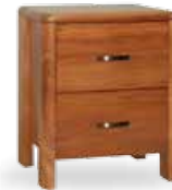
Bedside Cabinet 530w x 580h x 425d