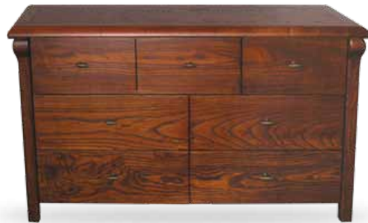
Lowboy 1395w x 825h x 515d