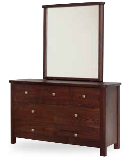
Mirror (Available mounted to Lowboy) 920w x 990h