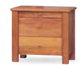
2 Drawer Bedside Cabinet 620w x 560h x 445d 2 Drawer Slim Bedside Cabinet 500w x 560h x 445d 3 Drawer Bedside Cabinet 620w x 740h x 445d