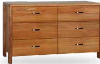
Lowboy 1350w x 800h x 485d