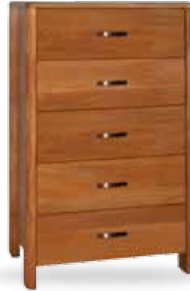
Towerboy 5dr 700w x 1240h x 425d