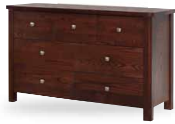
7 Drawer Lowboy 1370w x 820h x 490d