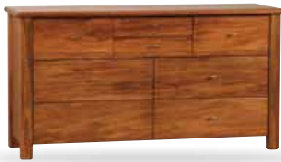
8 Drawer Lowboy 1545w x 820h x 505d

2 Drawer Slim Bedside Cabinet 500w x 560h x 445d 3 Drawer Bedside Cabinet 620w x 740h x 445d