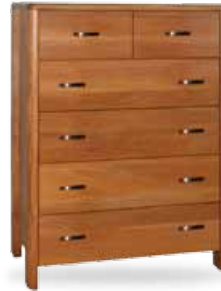
Tallboy 900w x 1240h x 485d