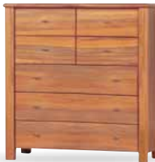
7 Drawer Tallboy 1010w x 1075h x 505d