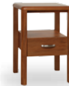
1 drawer nightstand 400w x 400d x 575h

Compatible with Cruise bedroom furniture.