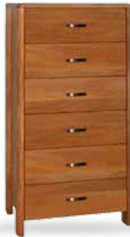
Towerboy 6dr 700w x 1465h x 425d