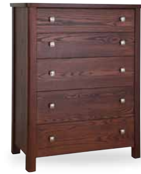
5 Drawer Tallboy 970w x 1200h x 490d

Shown in American White Ash in Autumn colour.