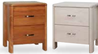
Bedside Cabinet 530w x 580h x 425d