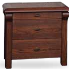
Bedside Cabinet 610w x 570h x 485d

Height to top of side rail: 385mm Clearance under side rail: 250mm