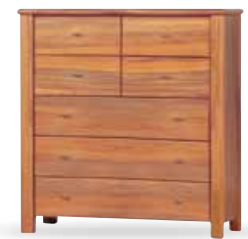
7 Drawer Tallboy 1010w x 1075h x 505d