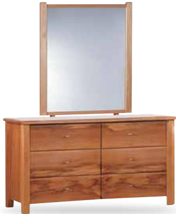
6 Drawer Lowboy 1545w x 820h x 505d * Mirror optional extra 900w x 1010h

Height to top of side rail: 405mm Clearance under side rail: 270mm Duvet end available.