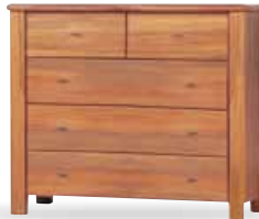
5 Drawer Tallboy 1010w x 505d x 885h