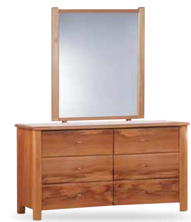
6 Drawer Lowboy 1545w x 820h x 505d * Mirror optional extra 900w x 1010h

Height to top of side rail: 330mm Clearance under side rail: 195mm Duvet end available.