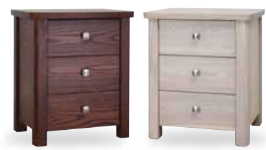
3 Drawer Bedside Cabinet 570w x 640h x 455d