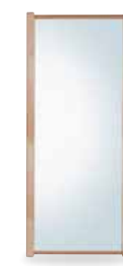
Free Standing Mirror 610w x 1520h