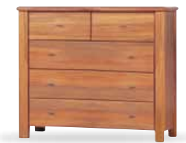
5 Drawer Tallboy 1010w x 505d x 885h