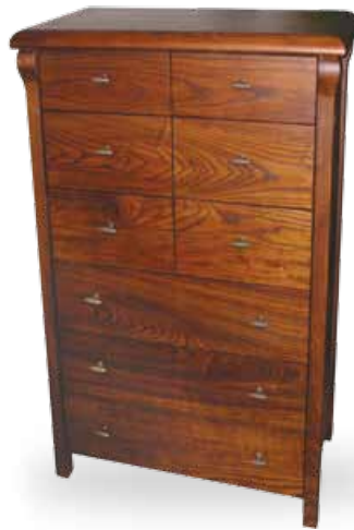
Tallboy 1000w x 1225h x 515d

Shown in American White Ash in Autumn colour.