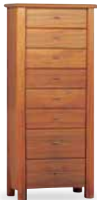
8 Drawer Slimboy 620w x 1390h x 445d