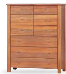
9 Drawer Tallboy 1010w x 1220h x 505d