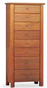
8 Drawer Slimboy 620w x 1390h x 445d