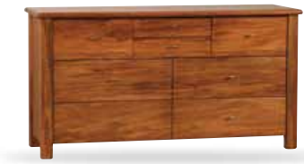
8 Drawer Lowboy 1545w x 820h x 505d